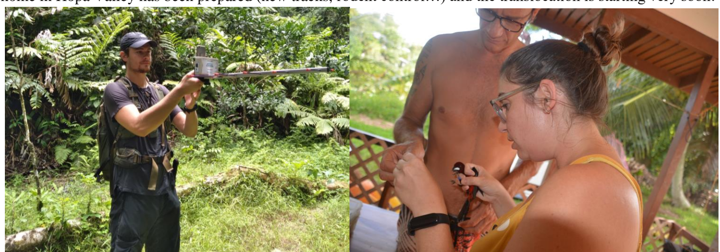
Monitoring and Manipulation training (on a Crimson-backed Tanager; careful of the beak!)

A number of 16 pairs have produced 17 fledgling, from which 16 survived. Nine nests are still active. The population has increased by 19% in one year. In order to reinforce the small sub-population of Hopa Valley, which has a high level of consanguinity, a translocation operational plan has been prepared in 2021, with the help of ten international experts. In order to avoid Monarchs flying back to the valley (adults are strongly territorial), several juveniles will be moved at the same time, when they start to become independent from their parents. Their new home in Hopa Valley has been prepared (new tracks, rodent control...) and the translocation is starting very soon!