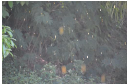
Drone application performed by Matarai Society – many thanks to them – the end of a nightmare for us?