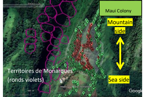
Ex-PK 17 and PK 18.2 colonies, and ex-Maui Colony, discovered in 2021 near Monarch's territories (red spots = positive to LFA, green spots = negatives)