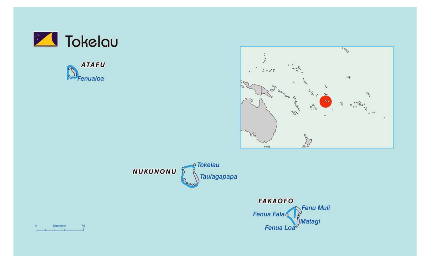
FIGURE 1 Map of Tokelau showing location and islands.