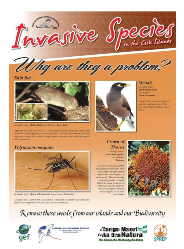
Example of Invasive Species posters produced by NES.