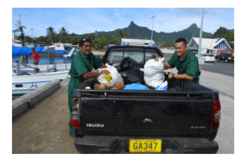
Photo: Agriculture officers take the confiscated fruit away to be burned. (Source: Biosecurity).

A recent Te Manava Vaka Festival illustrated the high risk posed by traditional vaka voyaging to the Cook Islands. Despite prior discussions between the Biosecurity Service and the festival organisers, Biosecurity staff found and destroyed over 30kg of fresh fruit on a vaka from French Polynesia, a country identified as one of the highest risk sources of invasive species for the Cook Islands. The Biodiversity Director identified in the media that this quantity of fruit could have concealed over 100 fruit flies.