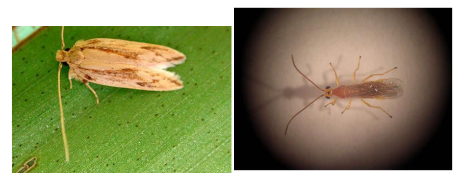
Photos: Coconut flat moth & parasitic wasp introduced as biocontrol.

The Coconut flat moth ( Agonoxena argaula ) arrived in Rarotonga in October 2000, apparently through an illegal importation of palms. An awareness campaign was established urging the public not to take any coconut and ornamental palms, including parts of palms such as leaves, nuts, and trunks, from the infested area, and but the moth spread rapidly to Aitutaki, Atiu, Mauke, Mangaia, Palmerston, Mitiaro by November 2003. A parasitic wasp ( Bracon sp.) was introduced from Fiji and has successfully reduced the impact of the moth.