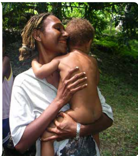
Impact of little fire ant on people and crops