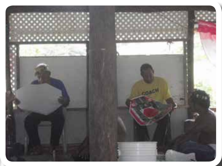
Invasive Species Presentation to College of Micronesia (agriculture class) (L). Target Invasive Species Posters were distributed to two of the Paramount chiefs of Pohnpei and was discussed during the Traditional Summit (R).