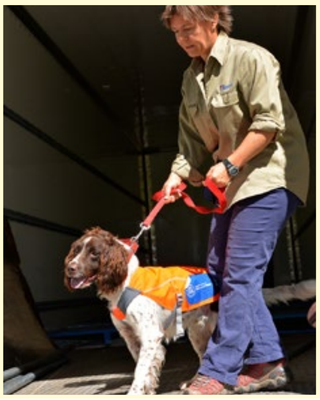
Reggie the cane toad detector dog.

Since the Cane Toad Strategy was launched in 2009, the Western Australian Government has begun implementing the $81.5 million Kimberley Science and Conservation Strategy. Integrating the efforts to mitigate the impacts of cane toads with land management and Aboriginal ranger programs being implemented through the Kimberley Science and Conservation Strategy will allow more effective action to be taken across the landscape.