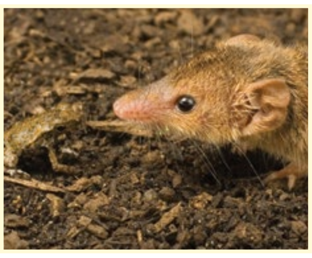
Native mammals like this planigale have an aversion to eating toads.