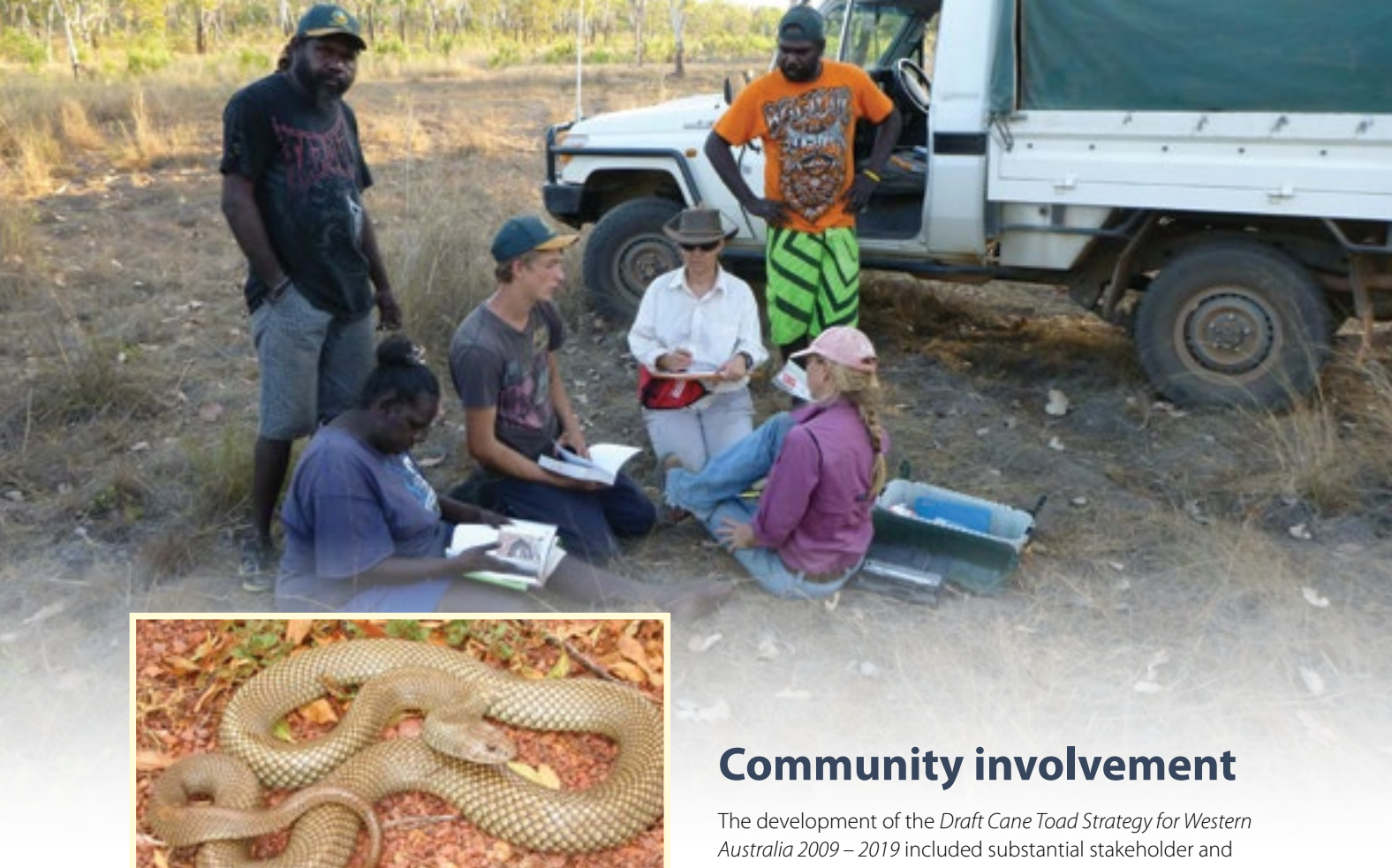
Mulga snake.