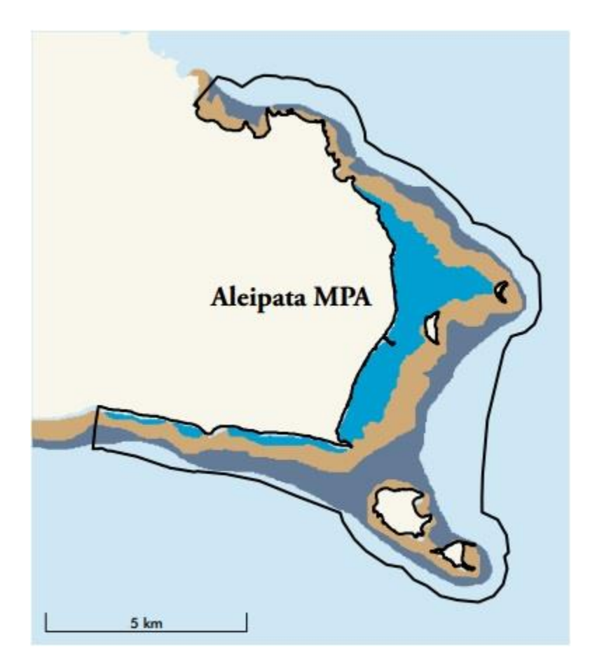
Figure 5. Aleipata marine protected area (MPA). Legend: area shaded in blue: lagoon; area shaded in brown: coral reef; area shaded in purple: reef slope; areas shaded in white: insular terrestrial ecosystems. Map: Conservation International et al. (2010).

The government in collaboration with the Aleipata District (eleven villages in total) and IUCN developed a management plan, the last update being for the period 2008-2010 (MNRE 2008), with the aim to guide the protection and conservation of the marine environment of