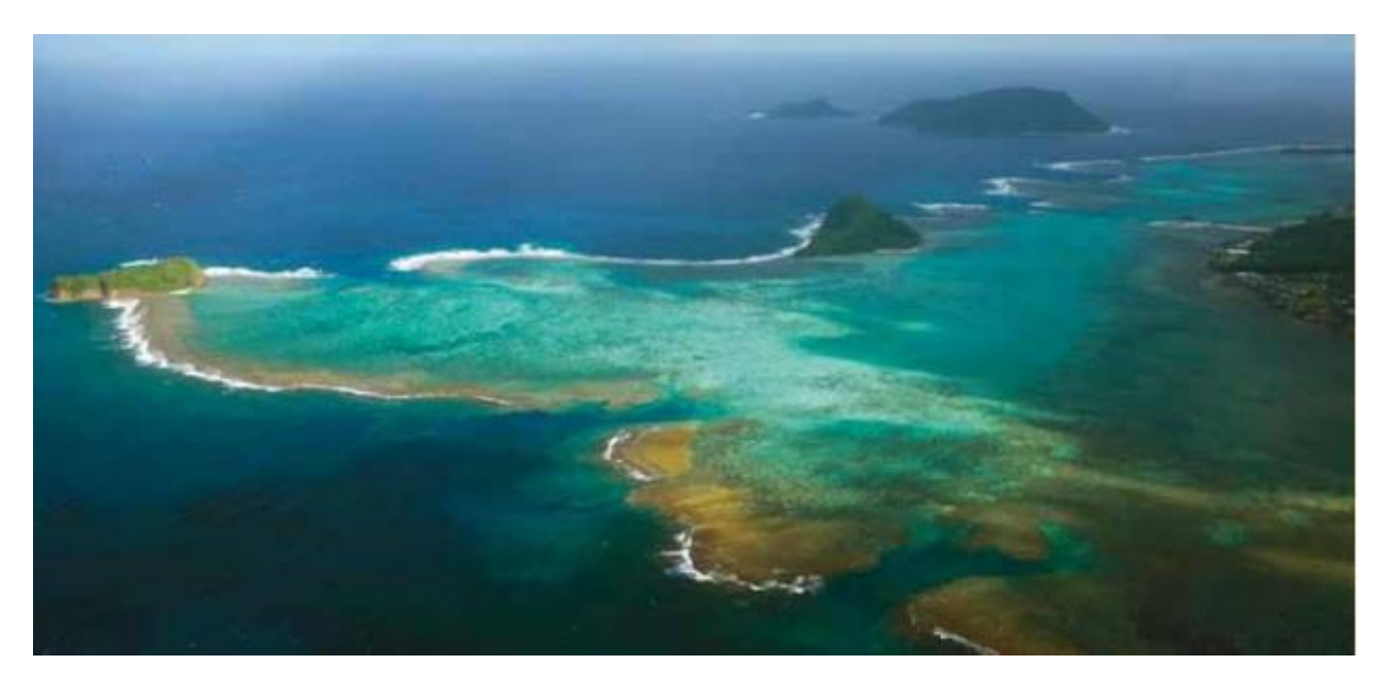
Figure 3. Aerial image of the four islands of the Aleipata group: foreground to the left, the Fanuatapu islet, next to the right still within the reef fringe Namua island (almost at the center of the image). In the background, Nu'ulua (small to the left) and Nu'utele (bigger to the right).

Figure 2. The four Aleipata islands face the easternmost tip of Upolu island of Samoa. North and at the edge of the reef fringe are located the smallest islands known as Fanuatapu and Namua, the latter being the closest to Upolu and the only inhabited one of the four. To the south, well outside the reef fringe, Nu'utele, the largest island of the four and Nu'ulua the most inaccessible one.