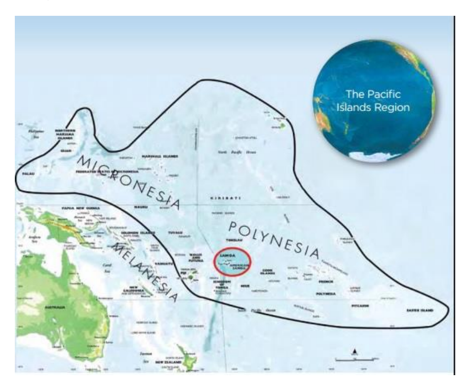
Figure 1. Polynesia-Micronesia Biodiversity Hotspot (Map: Conservation International 2013).

Samoa is part of the Polynesia-Micronesia Biodiversity Hotspot (Fig. 1), one of 34 regions of the world where extraordinary levels of biodiversity and endemism are coupled with extremely high levels of threats (Mittermeier et al. 2004). Although 11 terrestrial and 65 marine species found in Samoa are listed as globally threatened on the 2015 IUCN Red List of Threatened Species, the number of threatened species at a national level may be significantly higher than this, perhaps in the hundreds (Conservation International et al. 2010).