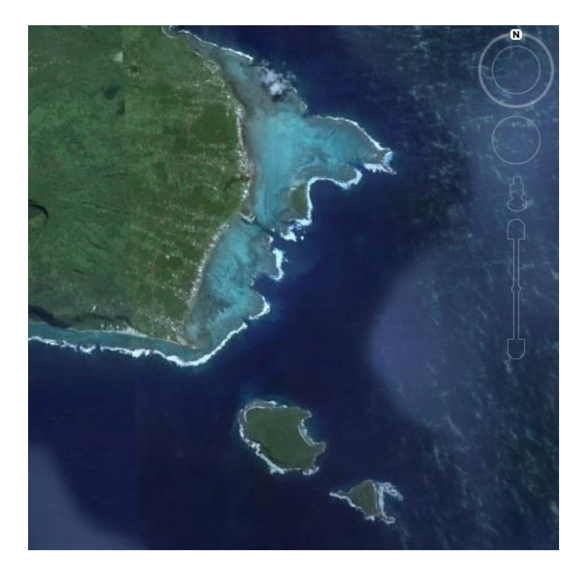
Figure 2. The four Aleipata islands face the easternmost tip of Upolu island of Samoa. North and at the edge of the reef fringe are located the smallest islands known as Fanuatapu and Namua, the latter being the closest to Upolu and the only inhabited one of the four. To the south, well outside the reef fringe, Nu'utele, the largest island of the four and Nu'ulua the most inaccessible one.