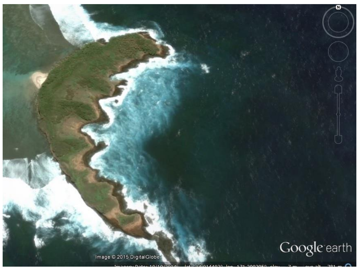
Map 4a. Islet of Fanuatapu.