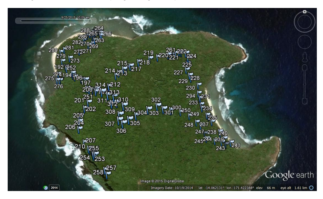
Map 1b. Zooming of Fig. 1a.

A spotlight night search was run on the first night soon after the arrival in Nu'utele aimed at detecting as many rats as possible, comprehensively covering- the so called Vini flats and partially the adjacent slope.