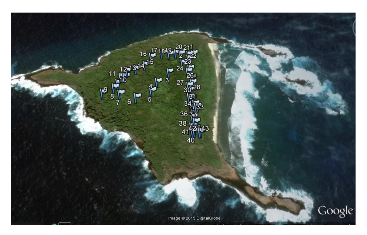
Map 2. Locations of forty-three sticky rat traps laid down across Nu'ulua on 26 October 2015 and associated sites of YCA assessment.