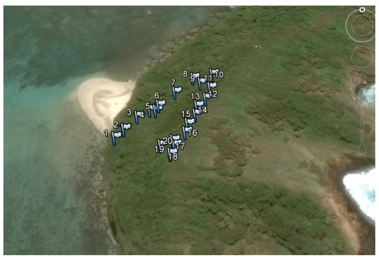
Map 4b. Locations of twenty rat sticky traps laid down across Fanuatapu on 28 October 2015 (Image: Google Earth).