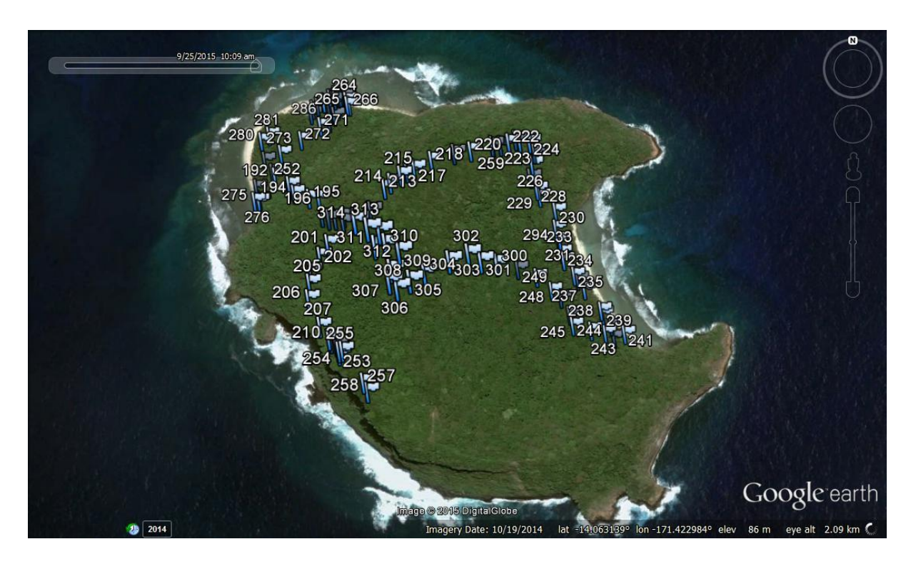
Map 1a. Distribution of 100 rat trap stations across Nu'utele island as they were established during days 22 and 23 September 2015. Each station was made up of a snap trap and a sticky trap, both featuring roasted coconut as bait.