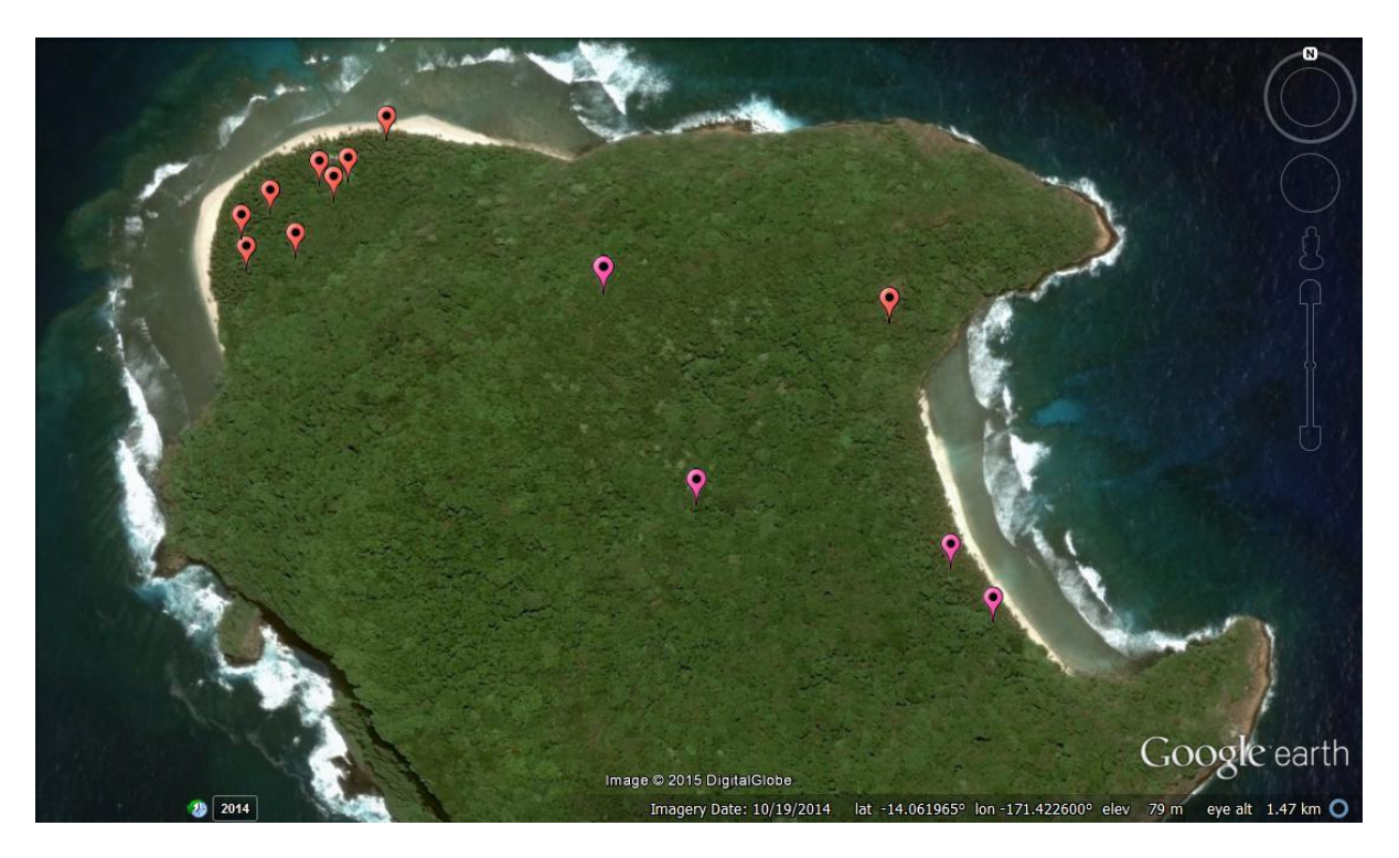
Map 5. Rat detections in Nu'utele. Red tags: rats caught in snap traps (1 baby in sticky trap); Pink tags: rats hair found in sticky traps.

All rats were identified as Polynesian rat. They were all adults except for a very young one caught on a sticky trap (head-body length= 50-60 mm). A total of six rats were detected at night using the spot light across Vini flats.