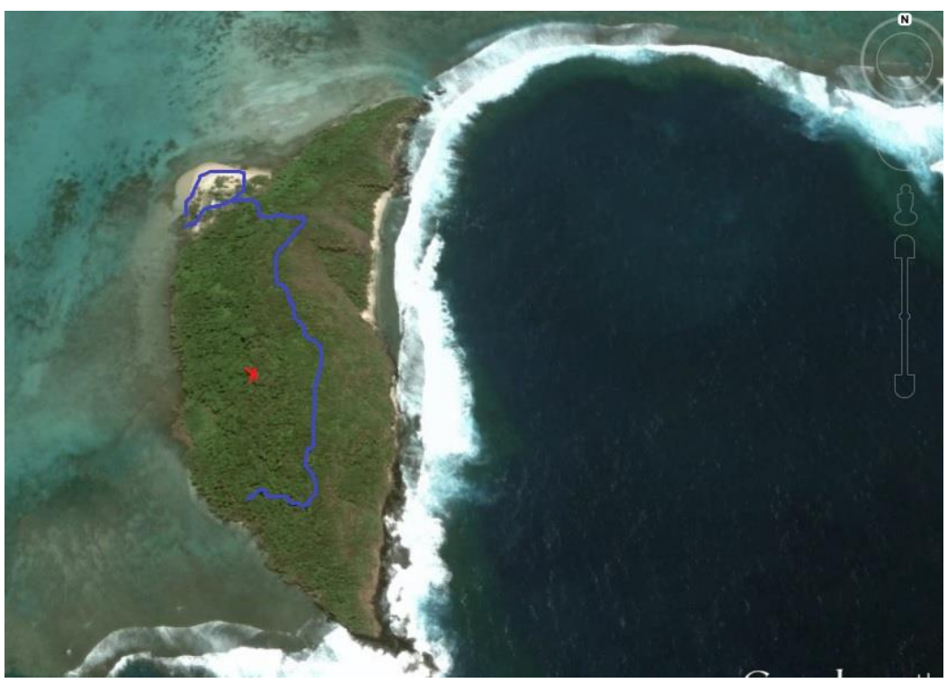
Map 3. In blue, the track followed on 29 October 2015 across Namua island. Red cross: location of roost of fruit bats Pteropus tonganus.