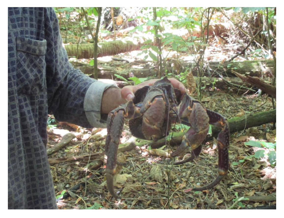
Photo 3. Coconut crab found on Vini flats during day-time.