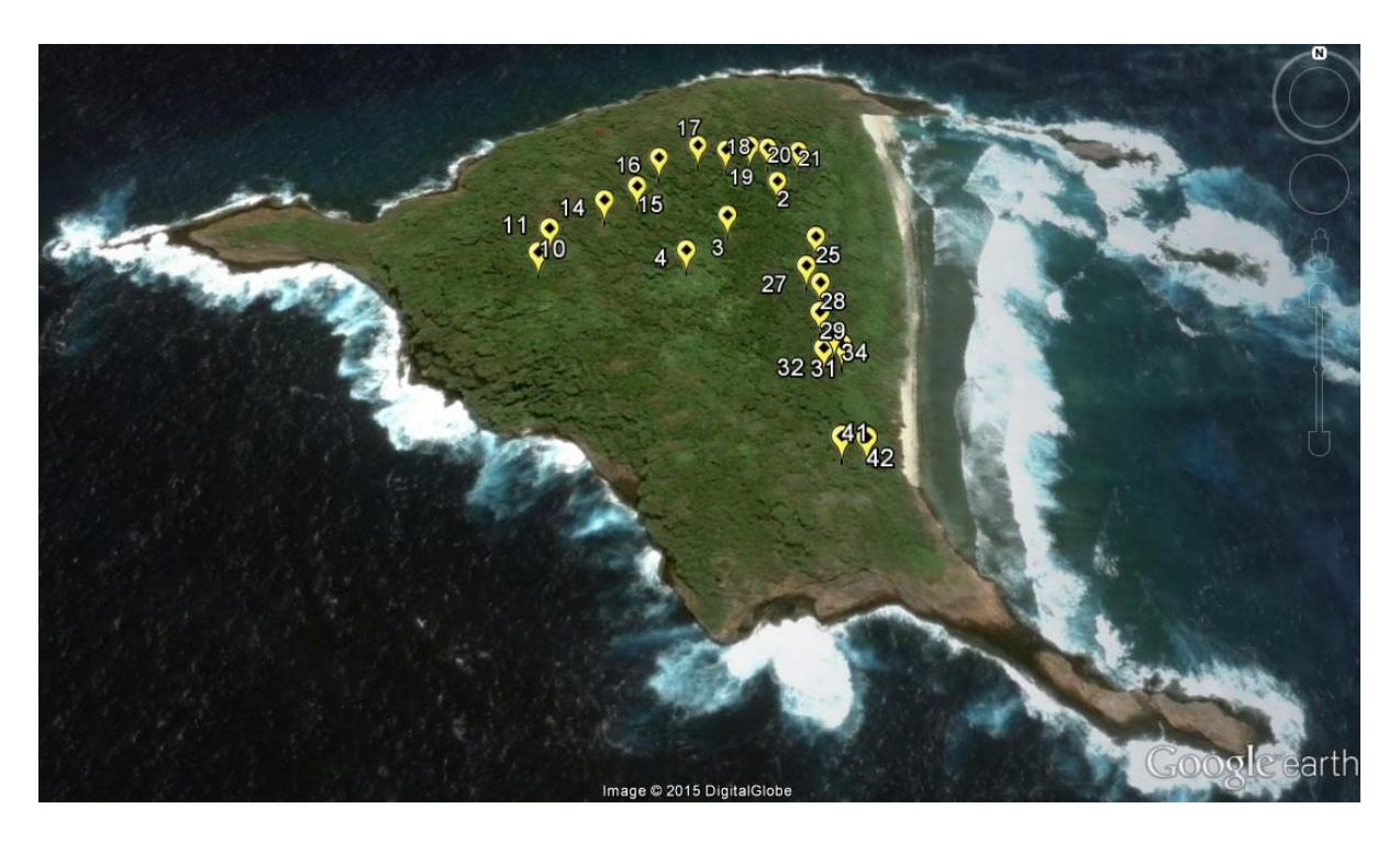
Map 8. Locations of detections of YCA along the transect used for the rat trap stations across Nu'ulua, as assessed on 27 October 2015 (Map: Google Earth).