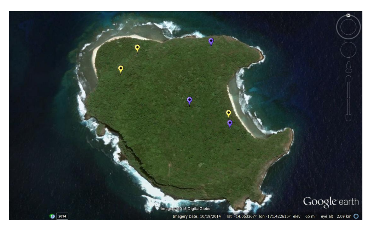
Map 7. Locations of detections of pigs. Yellow tags: direct visual detections; Purple tags: signs of pig activity and occurrence.

Pigs were visually detected on several occasions during the day and evidence of their presence recorded (Map 7). In particular, a quite large female with piglets was seen at least in one instance.