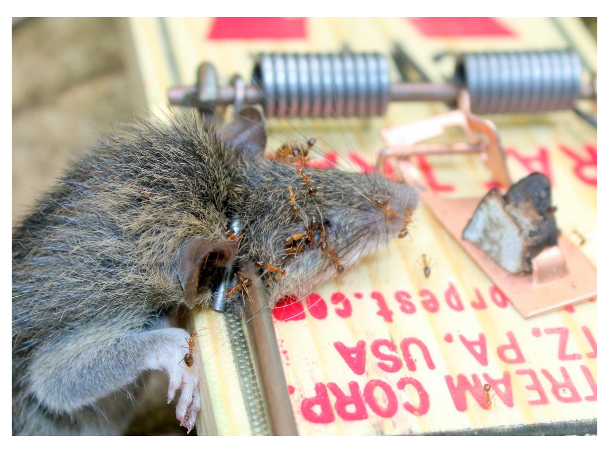
Photo 2. Polynesian rat caught in snap trap in Vini flats with YCA exploring the muzzle.